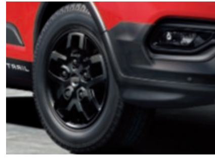
16" 10-spoke Ebony alloy wheels (Standard)