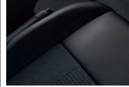
Partial leather seat trim (Standard)