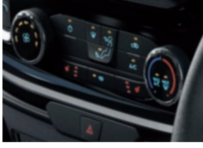
Air conditioning (Standard)