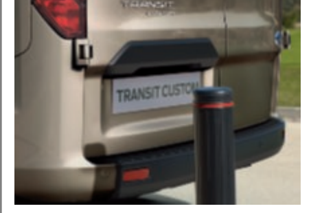
Front and rear parking distance sensors (Standard)