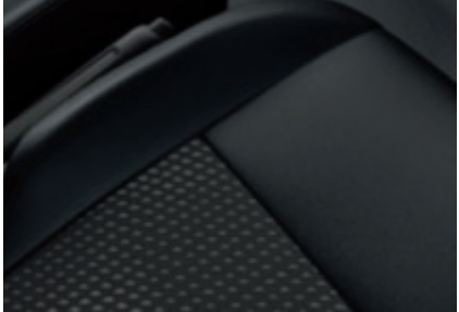
Partial leather seat trim (Standard)