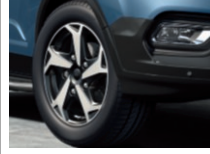
17" 5-spoke machined alloy wheels (Standard)