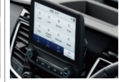
DAB/FM/AM radio with Ford SYNC 3 and satellite navigation (ICE Pack 24) (Option)

Transit Custom Limited L1 H1 shown in Magnetic metallic body colour (option).