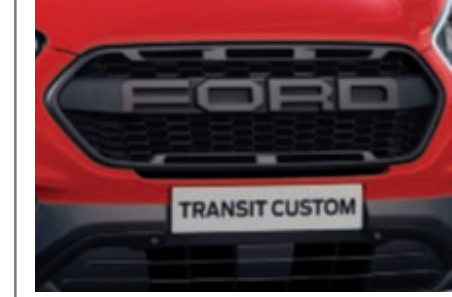
Unique front grille with FORD lettering (Standard)