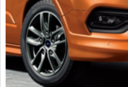
18" alloy wheels with 235/50R18 tyres (290 Van only)